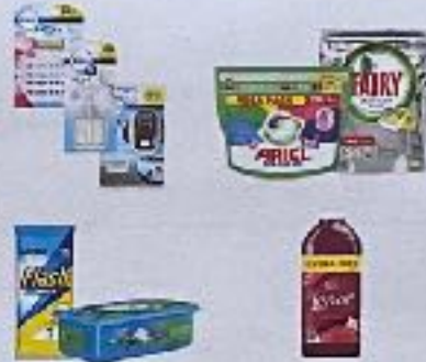
All brands accepted

Tinted (not transparent) fabric conditioner bottles and caps.