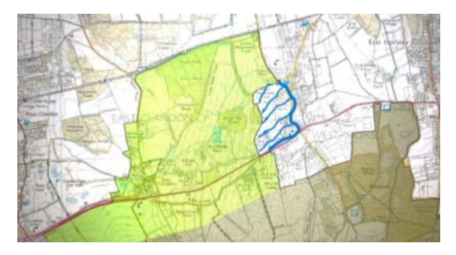
Figure 3: Proposal B – Extension to Candidate Area 6a at Hatchlands Estate