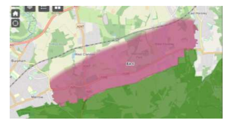
Figure 1: Original Surrey Hills AONB Boundary Review Evaluation Area EA6