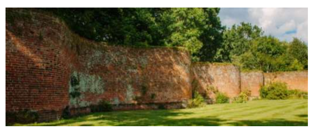
Crinkle Crankle/Serpentine Wall at West Horsley Place